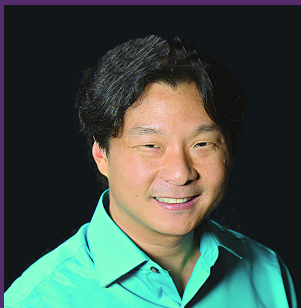
Hugh Sung piano