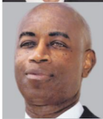
JULY 19, 10:30 AM & 7 PM Chaplain Barry Black United States Senate Washington, DC