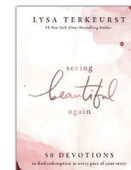
Seeing Beautiful Again

Just across the park from the Great Auditorium, The HUB has two of Lysa's books available: